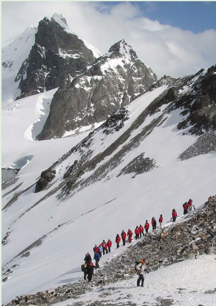
Guided tour for passengers from MS Polar Star , Spigot Peak, Antarctic Peninsula.

Over the last decade tourism in Antarctica has skyrocketed, becoming the biggest human activity on the continent. Although the Antarctic Treaty (1959) includes some guidelines relating to tourism, most regulations come from the travel business itself through guidelines prepared by the International Association of Antarctic Tour Operators (IAATO), established in 1991. Through these guidelines, IAATO has made a significant contribution toward rendering tourism in Antarctica environmentally sound.