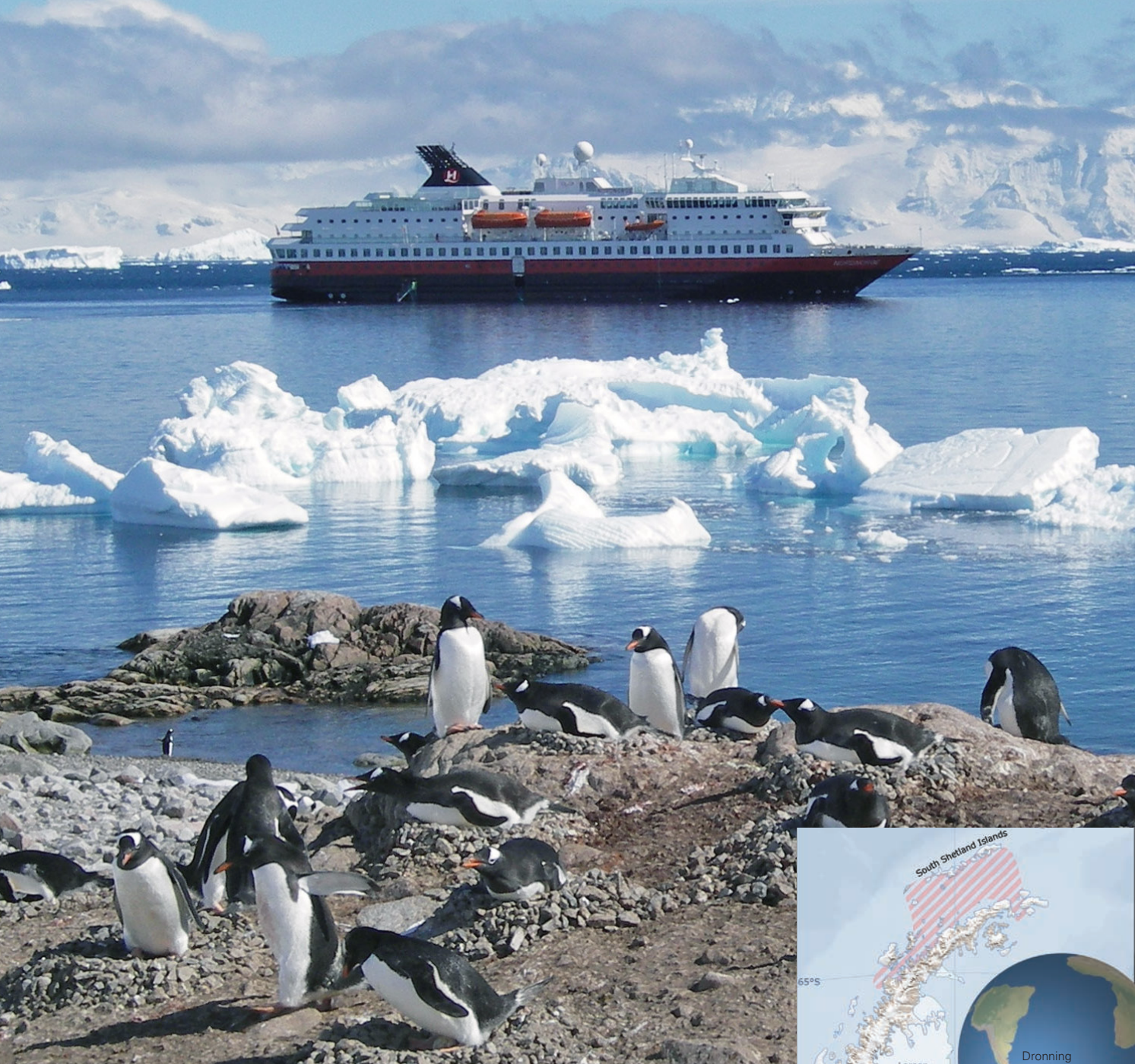
MS Nordnorge anchored at Neko Harbour.

Some of the most vast and least disturbed natural areas remaining in the world are found in Antarctica. Cruise tourism in Antarctica has increased dramatically during recent years. Norwegian cruise operators currently have a 20 % share of the market.