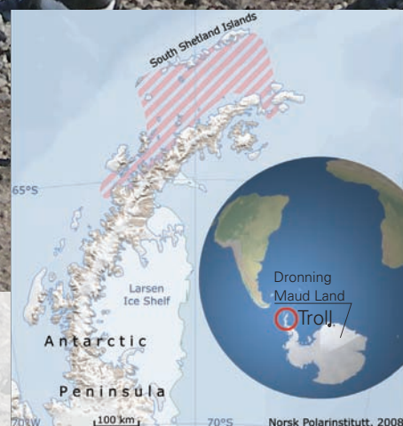
Map: Shaded areas show the main area for Norwegian tour operators.