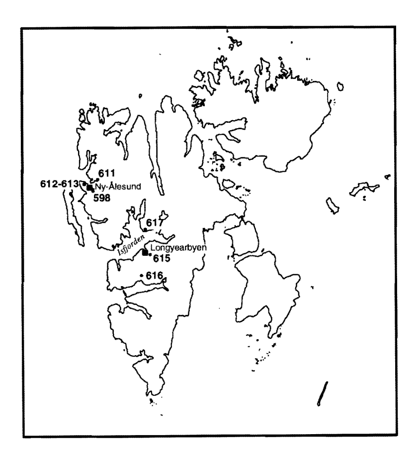
Fig. 1. Sampling sites in Svalbard for mosses studied in the present work.

The field work was carried out primo August 1993 at locations accessible from Longyearbyen and Ny-Ålesund by foot, rubber boat, or helicopter. The main work was concentrated on Hylocomium splendens , the moss species most frequently used for heavy-metal monitoring at more southerly latitudes, and also to a limited extent in Svalbard (Steinnes et al., 1993b). Since H. splendens is not easily found everywhere in Svalbard, additional sampling of Racomitrium lanuginosum , also under evaluation as a monitoring moss species in arctic North America (Ford et al., 1994), was performed at some sites in order to facilitate a comparison with H. splendens .