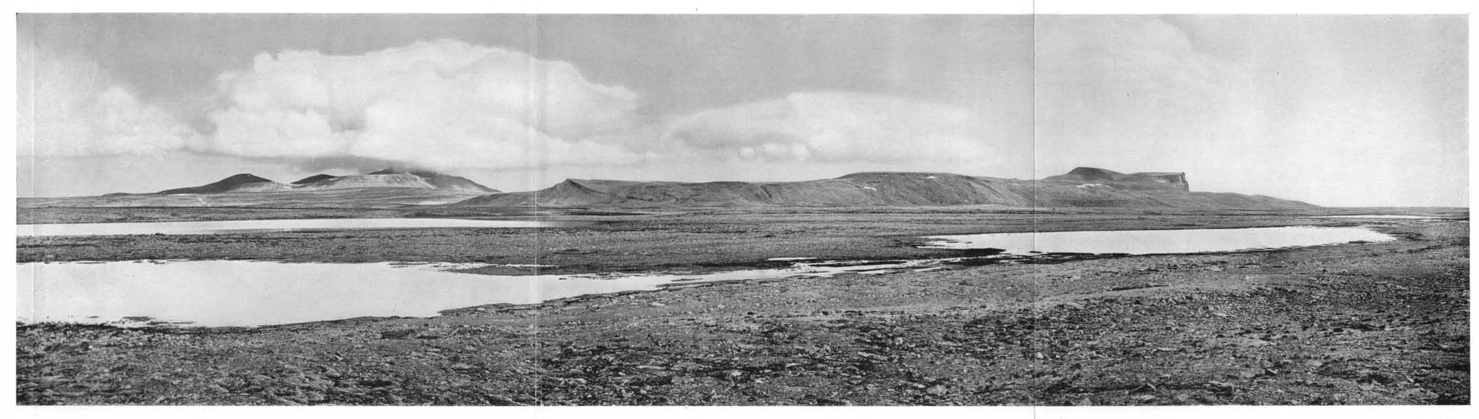
A. Miseryfjell and Oswaldfjellet. Looking southeast. In the background to the right are seen the plateaux of Alfred- and Hambergfjellet.

Skrifter om Svalbard og Ishavet. Nr. 15.