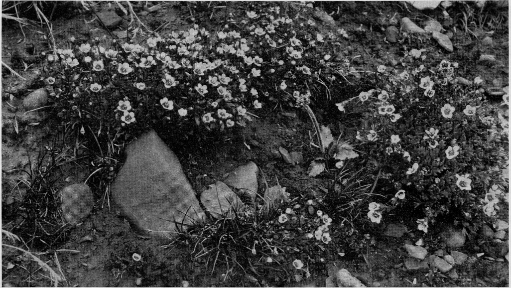
Fjellmark med tuesildre og i midten en snesildre

Tufted saxifrage ( Saxifraga cespitosa ) and, at center-right, a single alpine saxifrage ( S. nivalis ), one of many of Hanna's photographs illustrating Svalbards flora (1927b).