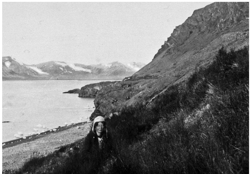
Hanna at Krossfjorden, Spitsbergen, in 1907.