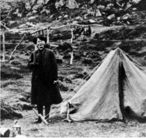
Hanna beside her tent in Laksefjord, Finnmark, 1909.

significant for Norwegian botany and for women in science and academics in Norway. Independent, resourceful, innovative, passionate, analytical and apparently not afraid to break with convention, she pushed forward the boundaries of what it was possible to achieve during her times and paved the way for many who followed.