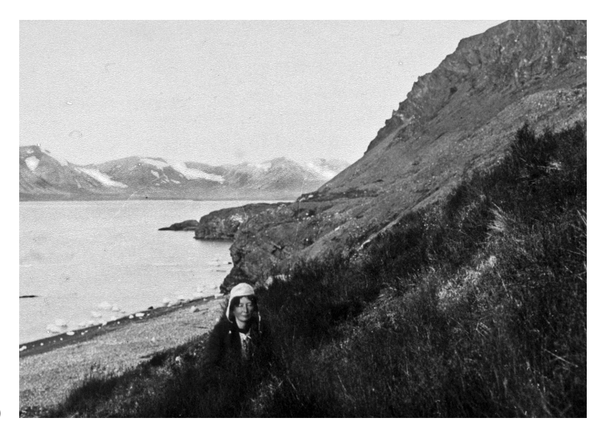
Hanna at Krossfjorden, Spitsbergen, in 1907.