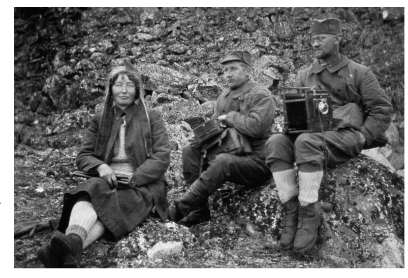
Hanna on the left and Adolf Hoel on the right, Spitsbergen, 1907.

Svalbard had been a no-man's land or, more accurately, an "everyman's land" (Barr 200: 59): commercially exploited for its natural resources (whales, pelts and, latterly, minerals) and, more recently, investigated by scientists of many nations, but under the sovereignty of none. Spear-headed by Norway's scientific expeditions, Norway's increasingly visible footprint in Svalbard culminated in the international recognition of the country's privileged position with respect to the archipelago, as codified in the so-called Svalbard Treaty of 1920 (Royal Ministry of Justice 1988; Barr 2003). With a mandate expanded to include Antarctica, Norway's Svalbard and Arctic Ocean Survey was renamed the Norwegian Polar Institute in 1948.