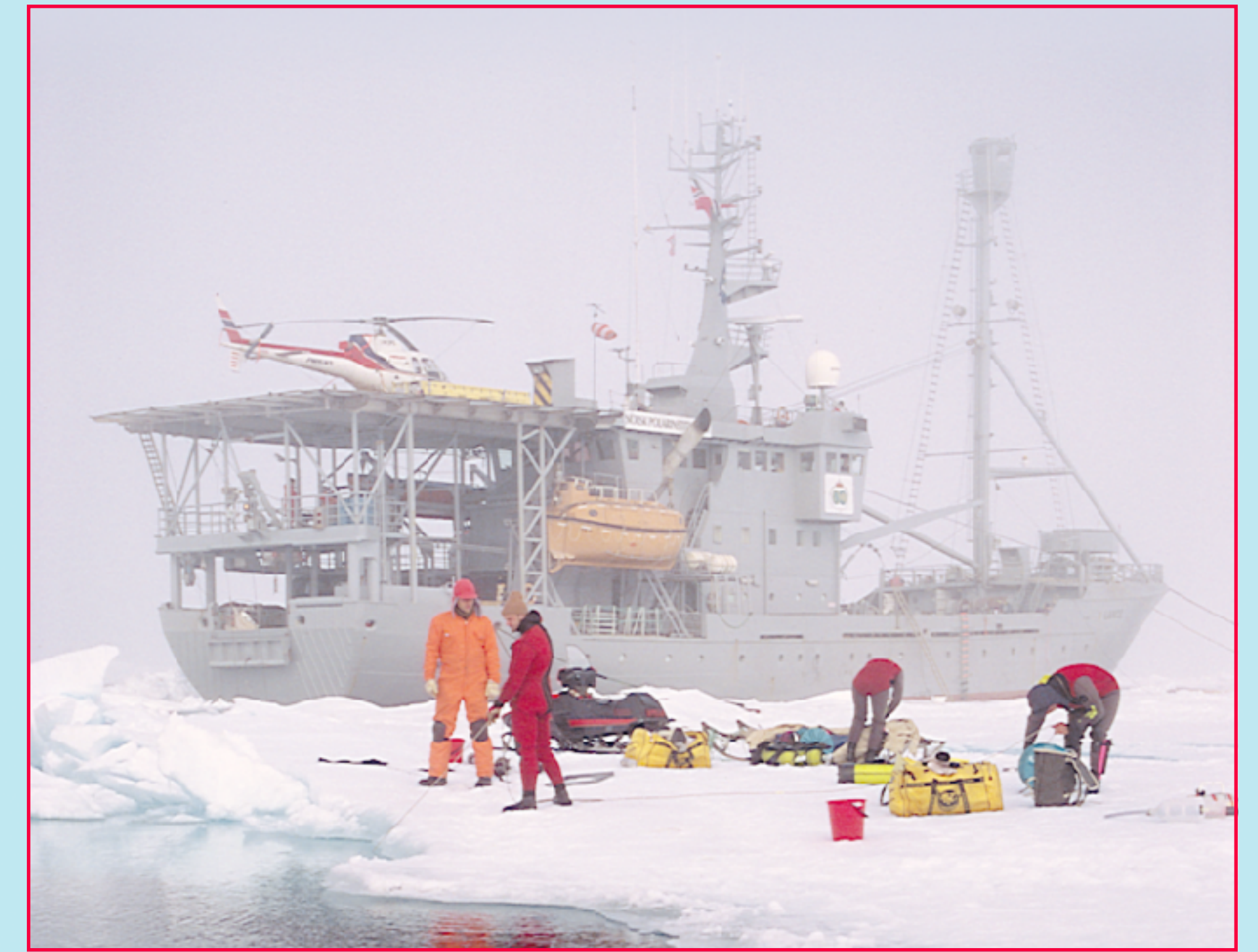
The Norwegian Polar Institute's research vessel R/V Lance