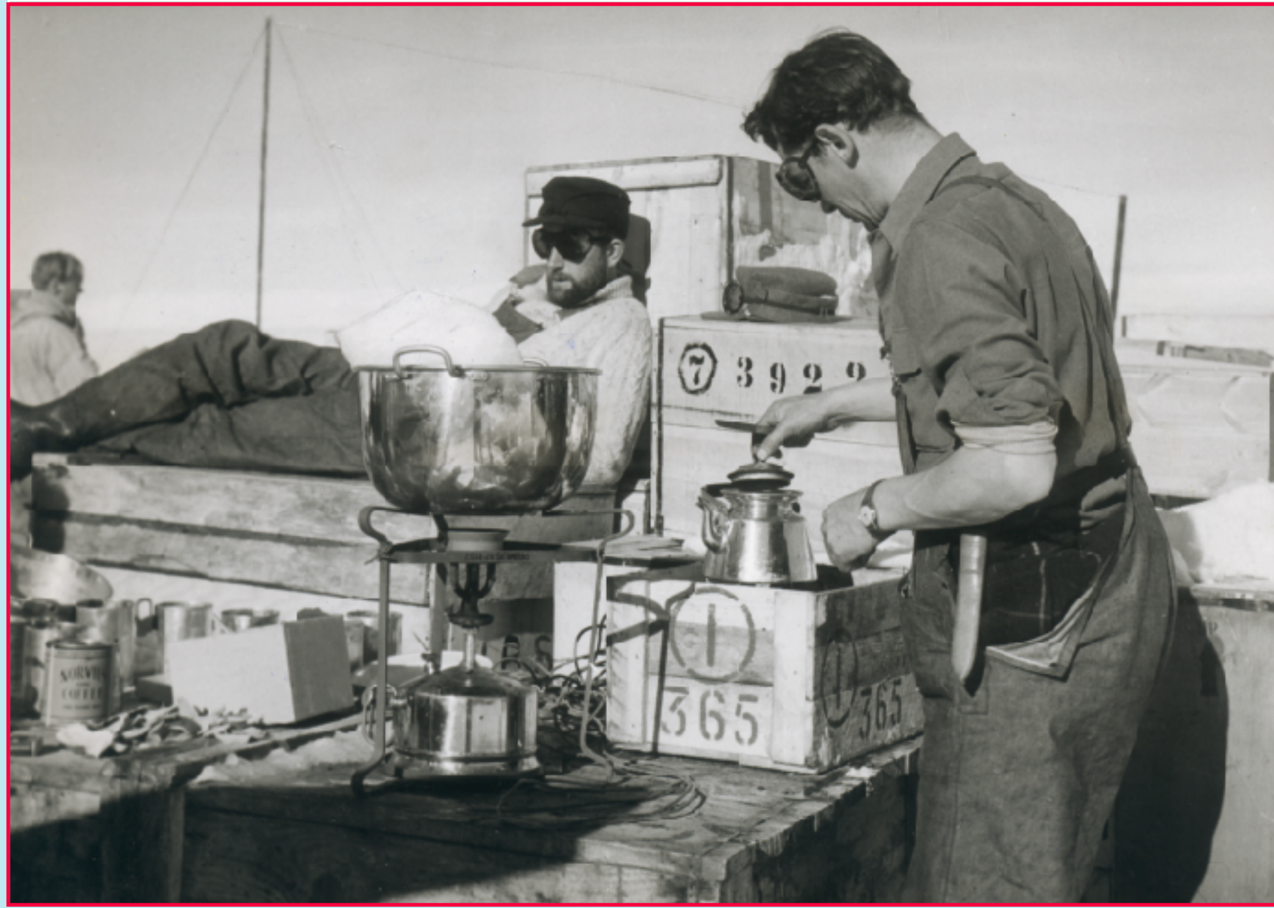
From the Maudheim Expedition (1949-52)

Norway is the only country that has dependencies both in the Arctic and the Antarctic, and polar issues have therefore naturally played an important role for the nation over the last century. In the Antarctic context it is Norway's aim to be an active partner in the cooperative management of the continent, and thereby contribute to maintaining Antarctica as a nature reserve dedicated to peace and science.