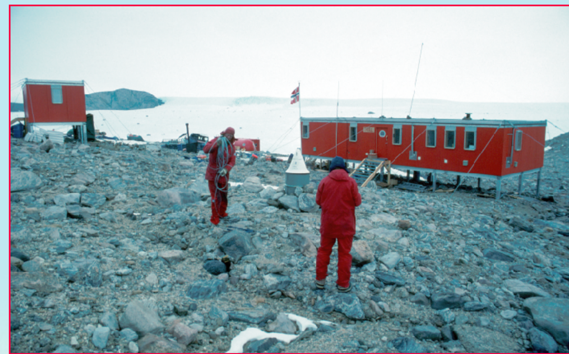
Troll station

The Norwegian Antarctic Research Expeditions have a relatively high scientist to support personnel ratio. During a normal operating season Troll station is staffed only with a small core support staff, ensuring necessary support for e.g. communication, equipment maintenance and medical emergencies.