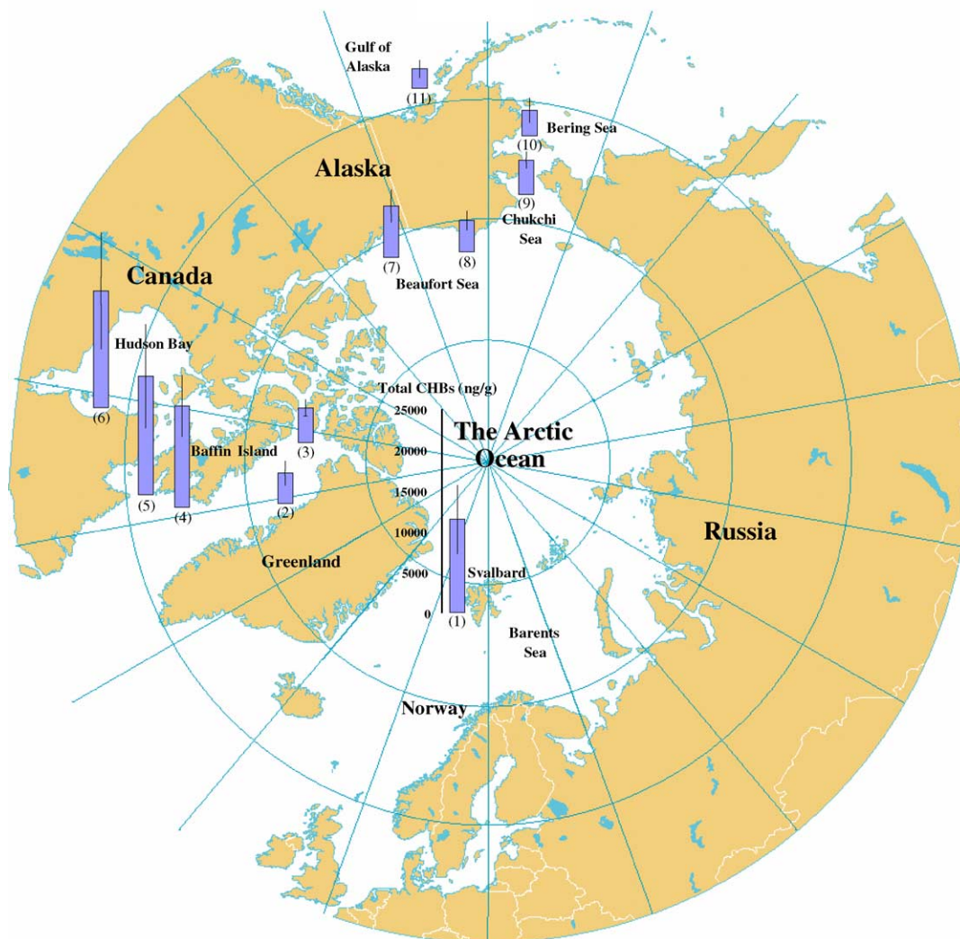
Fig. 3. Mean concentration (ng/g) \pm SD of Total CHBs in the blubber of male white whales from various arctic stocks. CHB results from this study are determined using a congener-specific method based on analyses of three congeners; CHB-26, -50 and -62. Total CHB, or \Sigma CHBs, reported in this study is the sum of these three congeners. Total CHBs in the other white whale stocks is calculated by summing up the area of 19 or 20 peaks in the chromatogram using technical toxaphene as a standard. The Total CHB levels from all the stocks are presented on a wet weight basis, except the levels of \Sigma CHBs in the Svalbard stock, which are presented on a lipid weight basis. Data are compiled from: (1) Svalbard: current study, (2) W. Greenland: Stern et al. (1994), (3) Jones Sound: Muir et al. (1990), (4) Cumberland Sound, (5) S.E. Baffin Island and (6) S. Hudson Bay: Muir et al. (1999), (7) S. Beaufort Sea: Muir (1994, 1996); de March et al. (1998), (8) E. Beaufort Sea: Muir et al. (1990), (9) E. Chukchi Sea, (10) E. Bering Sea and (11) Cook Inlet: Becker et al. (1995, 1997); Krahn et al. (1999).

lipid basis, while CHB levels from other areas presented in Fig. 3 were expressed on a wet weight basis (74–95% lipids; Muir et al., 1990, 1999; Muir, 1994, 1996; Stern et al., 1994; Becker et al., 1995, 1997; de March et al., 1998; Krahn et al., 1999). Thus, the Svalbard results might be slightly upwardly biased