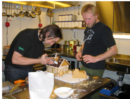
Når en pepperkake baker, baker pepperkaker.