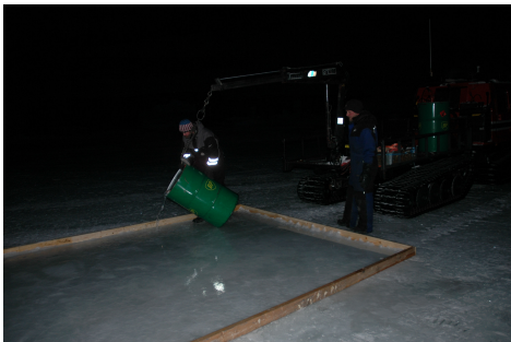
En curlingbane blir til.