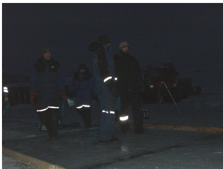
Dyp konsentrasjon i piten av curlingbanen.