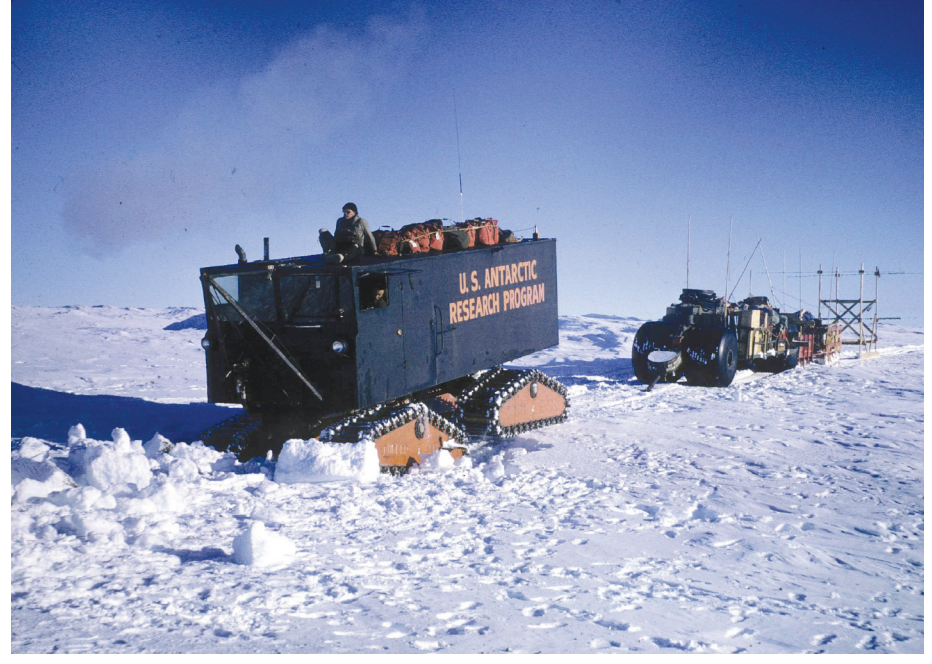
Figure 2 | Scenes from above the shores of the Recovery lakes. The 1965–66 US–UK South Pole– Queen Maud Land traverse, showing a Sno-Cat tractor and, in the background, a 'rolly' tyre set containing fuel, and the ice-sounding radar antennae. The tractor is just crossing a crevasse at the edge of the Recovery ice stream, near where Bell et al. <sup>2</sup> have now discovered four subglacial lakes.

During the forthcoming International Polar Year, a number of land traverses and aerial campaigns are planned for Antarctica. In 2008, a Norwegian–US traverse will survey the Recovery lakes area. This was last visited by the US–UK traverse from the South Pole to Dronning Maud Land in 1965–66. Interestingly, that early expedition, which was equipped with one