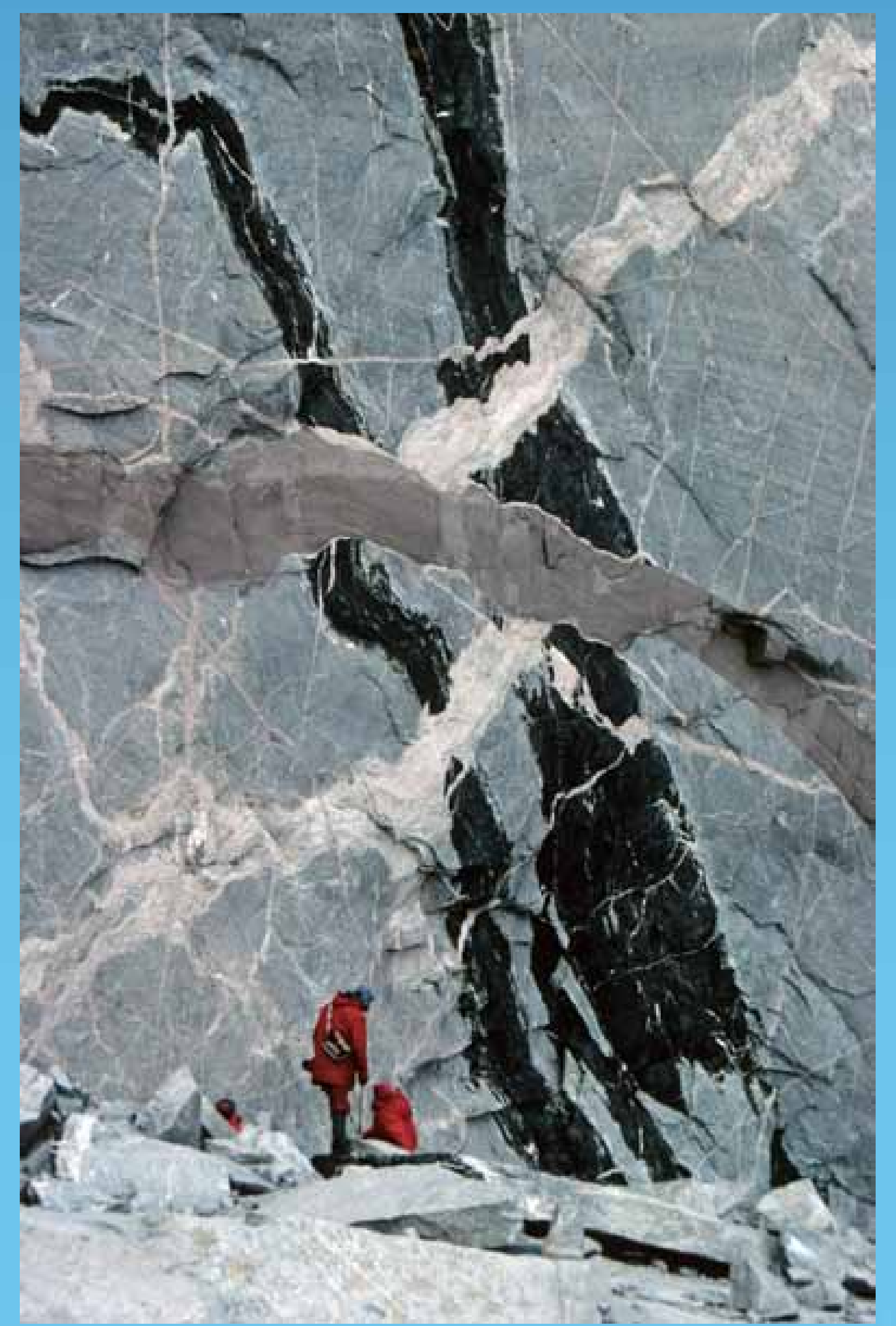
A rock wall in Jutulhogget by the Norwegian base Troll in Dronning Maud Land, Antarctica. Igneous dikes reveal the sequence of events deep inside the Earth's crust throughout the ages.

NPI also publishes a report series (Norsk Polarinstittutt Rapportserie) and a variety of other publications for scientists and the general public. The image library contains 40 000 historical and contemporary photographs from the polar regions. The NPI web-site, www.npolar.no , offers detailed information about selected aspects of the polar environment.