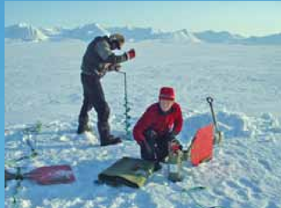
Deployment of current meters below the fast ice at Kongsfjorden, Svalbard. Water current below the sea ice are crucial for energy fluxes at the ice-ocean interface, and within that for freezing and melting processes.

search for an understanding of climate change by considering climate variability and feedback in the sea ice - land - ocean - atmosphere system in the polar regions, to assess the system's sensitivity to disturbances, and to analyse the consequences of a changing climate. NPI polar climate monitoring programmes collect data in collaboration with national and international institutions under research initiatives. The Marine Ecology Programme, led by K. M. Kovacs, PhD, is designed to provide sound scientific advice to Norwegian and international agencies responsible for resource management and conservation issues in the polar regions. It also strives to maintain a more general scientific expertise about polar marine systems, and contribute high quality scientific knowledge to the global knowledge base regarding Arctic and Antarctic marine fauna.