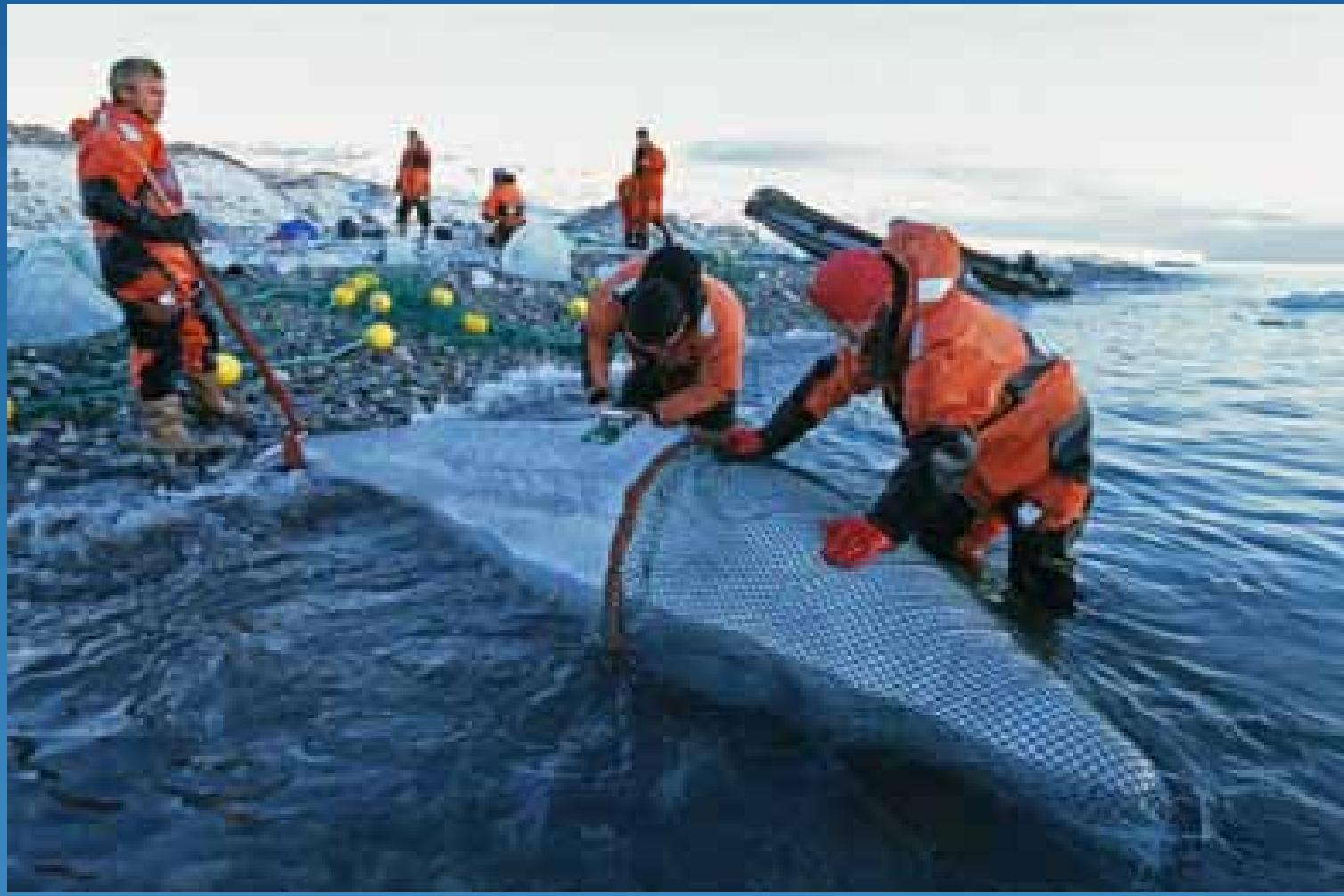
Equipping live-captured white whales with satellite transmitters to study movements and diving patterns in the Svalbard area.