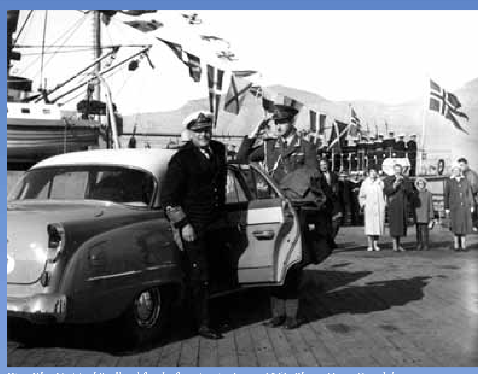
King Olav V visited Svalbard for the first time in August 1961.

The opening of the airport in 1975 greatly facilitated access to Longyearbyen by scientists and others. The NPI established offices, field operations and equipment storage rooms in the hangar. In 1980 the Institute moved to Næringsbygget, while field operations and storage remained at the airport. Finally, in 2006, NPI's Svalbard branch was reunited under one roof in the Science Park.