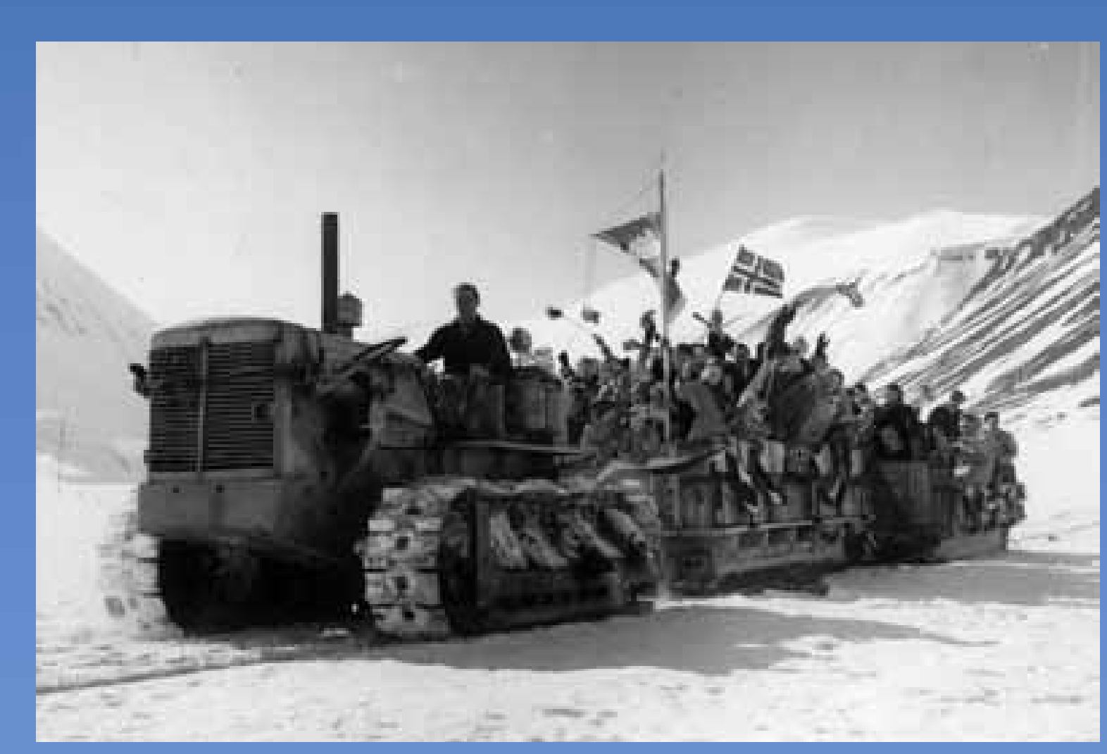
Celebrating the 17th of May in Longyearbyen, 1953.

1947 New lodging quarters, an office building, hospital and three family dwellings erected on Haugen